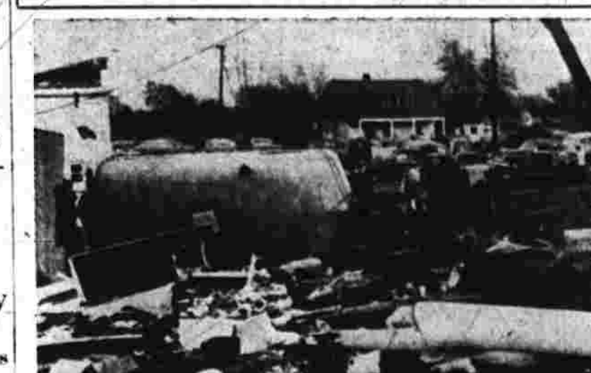
This was all that remained of a trailer camp on the edge of Findlay, O., after a tornado ripped through it, wrecking 42 trailers.

Washington, May 15.—(AP)—Bowles today proposed a 10 per cent price roll back and a 20 per cent tax cut program.